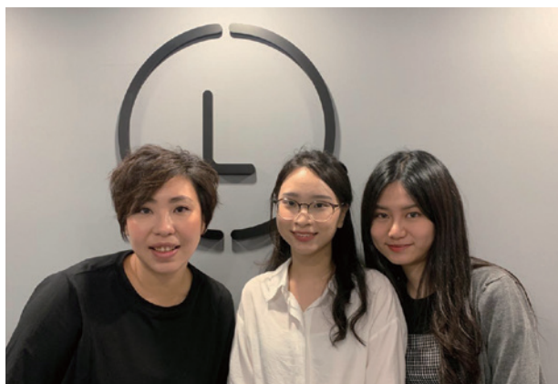
Summer Placement Scholarship Programme 2019 at Luxasia (HK) Ltd. 於Luxasia (HK) Ltd. 進行2019 暑期實習獎學金計劃