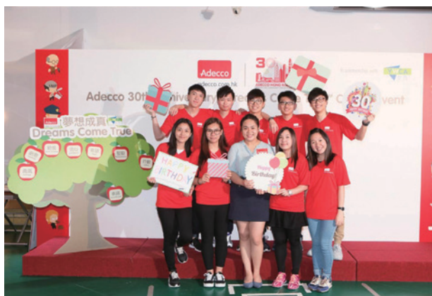
Internship at Adecco 於Adecco實習