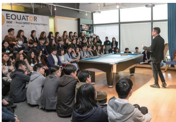
DDB Group Hong Kong Open Day 恒美廣告國際有限公司開放日